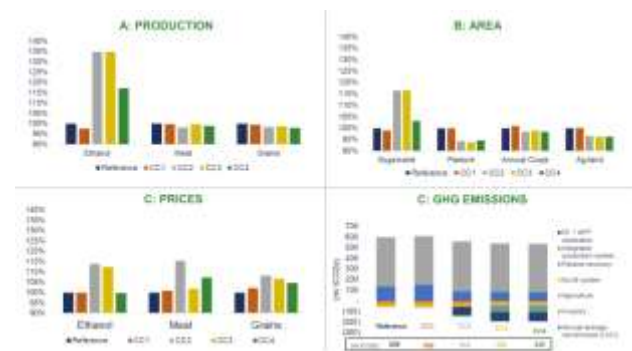
Fig. 2: Results of reference and alternative scenarios for production, area, prices and annual GHG emissions in 2030.

In Figure 2, the agricultural production (Figure 2.A), area (Figure 2.B), and prices (Figure 2.C) are presented in relative terms, whereas GHG emissions are presented in absolute terms (Figure 2.D).