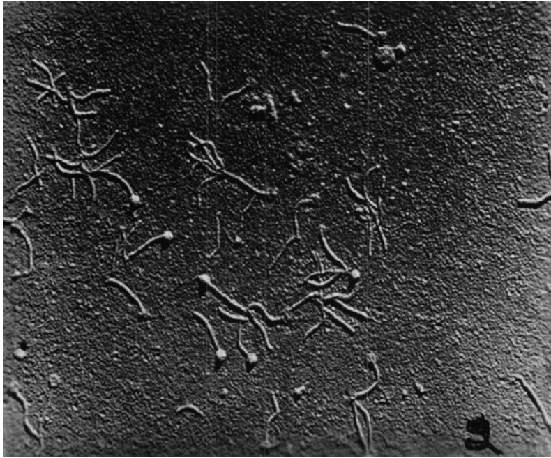
Fig. 1. Corynebacteriophage beta released from toxinogenic C. diphtheriae are capable of transforming non-pathogenic strains to toxin-releasing strains which are virulent in animal models. Reprinted with permission from [1].