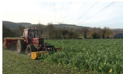
Fig. 2. Strategies to optimize interactions with beneficial microbes to improve plant nitrogen (N) acquisition. Various strategies can be combined to reduce the use of N fertilizers and improve crop N acquisition. They include (i) capitalizing on the beneficial impact of microbes either individually or when they are present in tripartite associations; (ii) utilizing plant genetic diversity to select the most efficient interactions in terms of the acquisition of nutrients, N in particular; and (iii) developing agronomic practices such as no-till and those based on the use of cover crops that favor plant–microbe interactions (Hirel et al. , 2011).