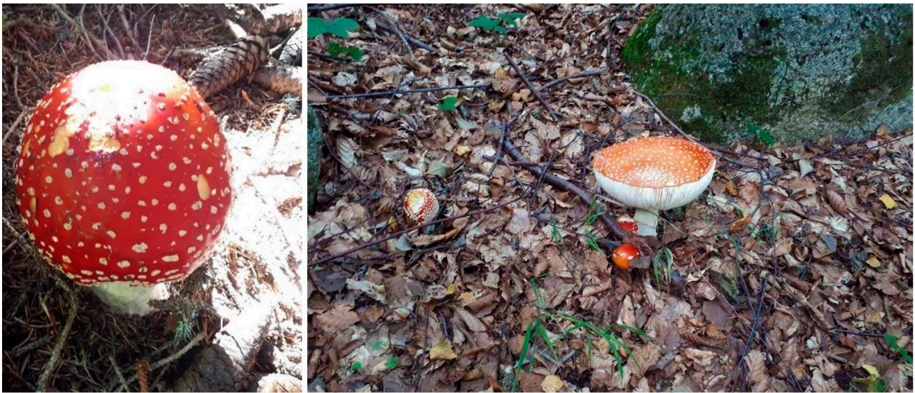
Figure 1. Basidiocarps of A. muscaria observed in the French Prealps (Alpes-de-Haute-Provence, France).