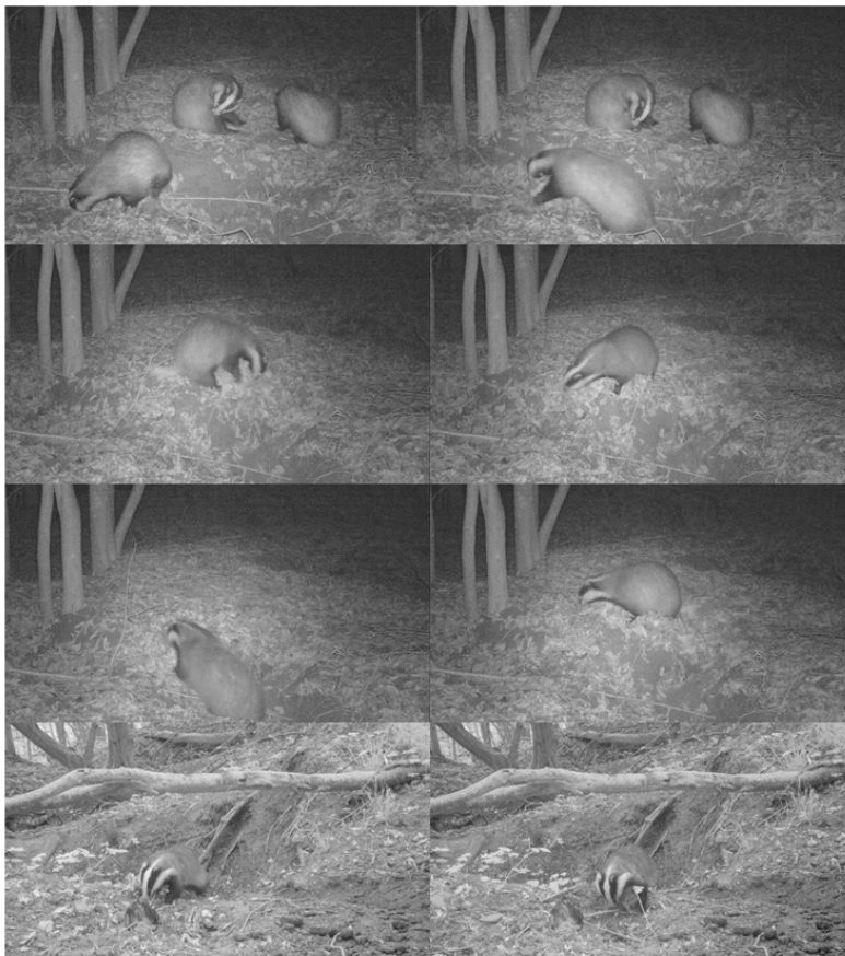
Fig. 2 Bedding collecting in early November. The bedding dragged into the burrow was made up exclusively of bundles of hornbeam leaves collected in the surrounding area of the burrow (screen capture from videoclips).