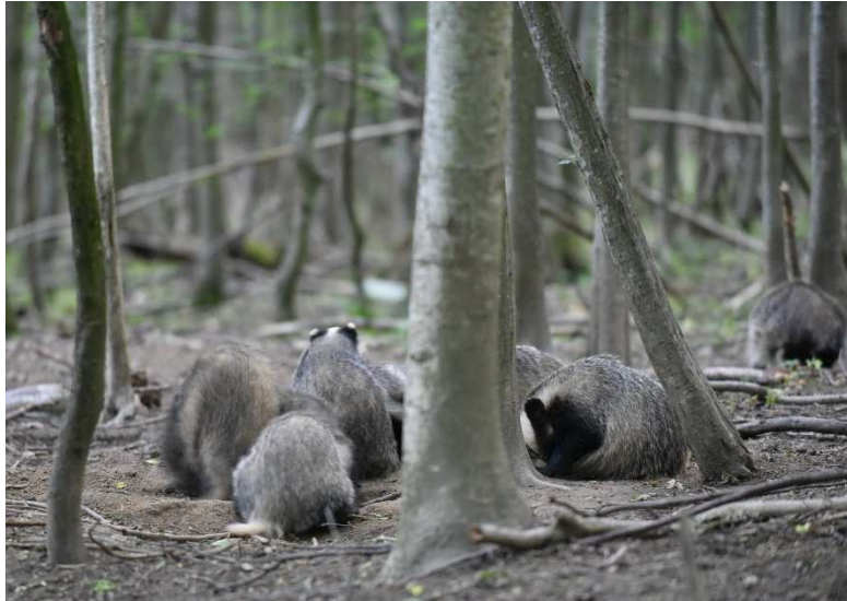
Fig. 1 Collective grooming (seven badgers) in May just after the emergence of the burrow.