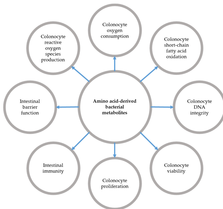
Figure 2. Schematic view of the effects of amino acid-derived bacterial metabolites on colonic epithelial cell physiology and metabolism, and on mucosal homeostasis.

Collectively, the data reviewed above indicate that a modification of protein intake is not sufficient to induce an overt perturbation of the intestinal homeostasis that could contribute alone to IBD pathogenesis. This conclusion fits the multifactorial etiology of IBD and the results of most of the epidemiological data, reporting no significant association between protein intake and IBD incidence [15]. However, it is important to consider the short duration of the studies cited above (generally only a few weeks) precludes to conclude on the long-term effects of an HP consumption on gut health.