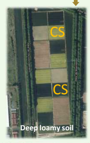
Field trial located in Versailles (C.S.: Current System)