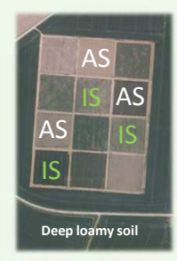
Field trial located in Grignon (A.S.: Advanced System; I.S.: Intermediate System)